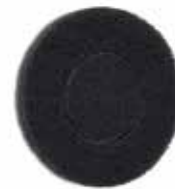
Black Standard Pad