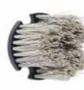
Long Bristle Brush