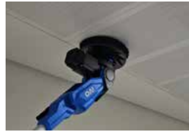
Ceilings & air vents

“Put power in the hands of your cleaners!”