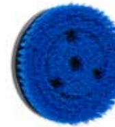
Blue Medium Brush