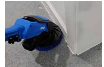
Edges & corners