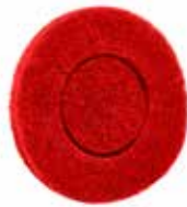
Red Standard Pad