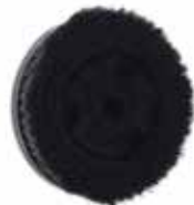
Black Soft Brush