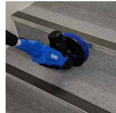
Stair treads & risers