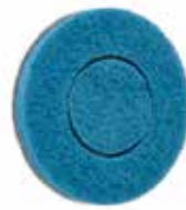
Blue Standard Pad