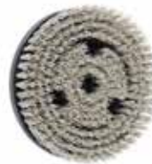
Grey Tough Brush